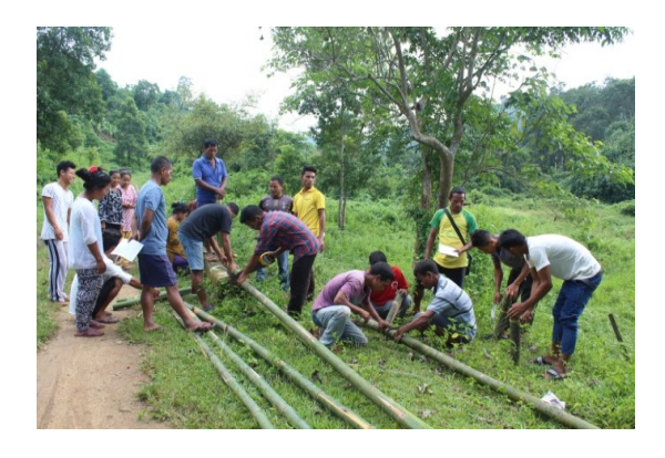
Fig.2. (Villagers partake on Go Green Technology)