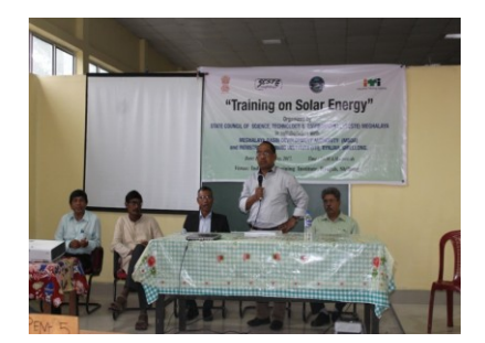
(Training on Solar or Green Energy)

iii. Hydroponics Technology : Initiatives had also been taken implement for ornamental plants and vegetable for food security and training schedules and modules have been developed to train entrepreneurs and farmers in the technology.