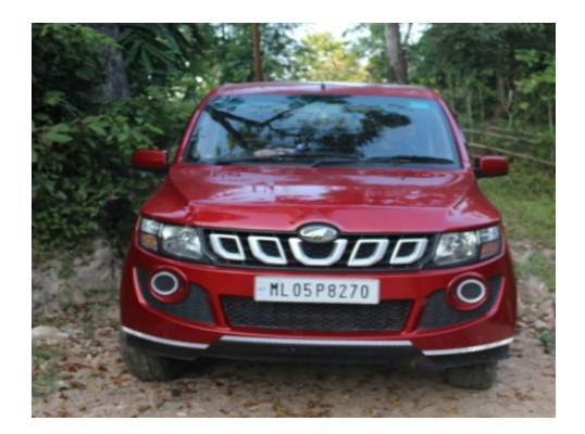
Fig.1 (Wheel-Go Green)